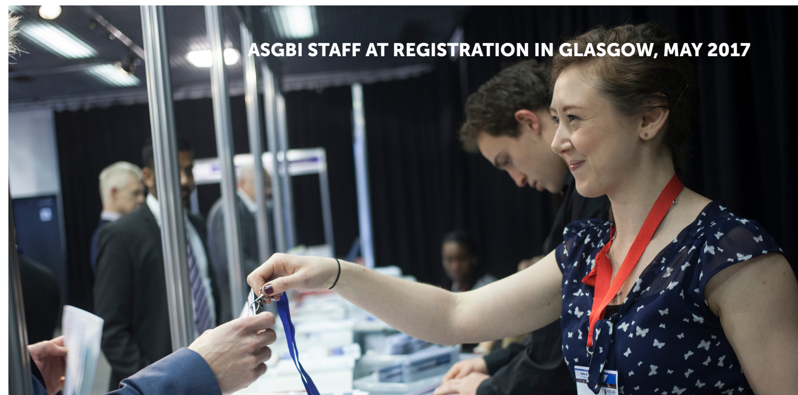
ASGBI STAFF AT REGISTRATION IN GLASGOW, MAY 2017