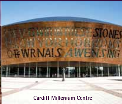
Cardiff Millennium Centre