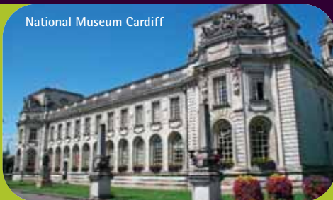
National Museum Cardiff