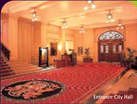
Entrance City Hall