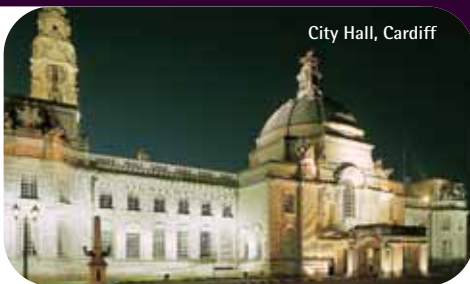
City Hall, Cardiff