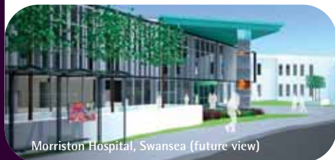
Morrison Hospital, Swansea (future view)

For full directions on how to get to the City Hall & WIMAT, Cardiff, please visit www.cardiffcityhall.com www.cardiff.ac.uk/pgmde/sections/wimat/index.html